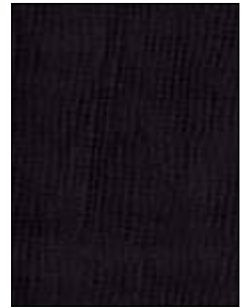
[Molten Byzantium 2902]