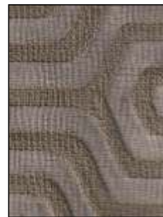
[Mercury Truffle 2803]