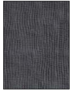
[Molten Moss 2901]