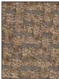
[Maize Truffle 2703]