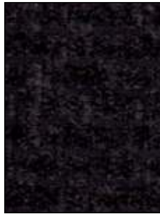
[Maize Byzantium 2702]