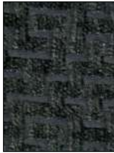
[Maize Moss 2701]