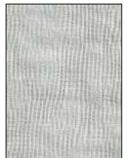
[Molten Cornsilk 2904]