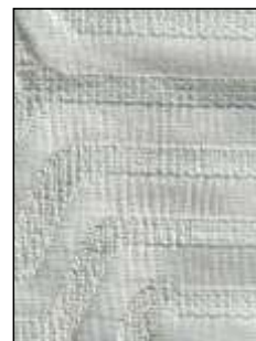
[Mercury Cornsilk 2804]