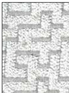
[Maize Cornsilk 2704]