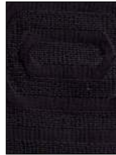
[Mercury Byzantium 2802]