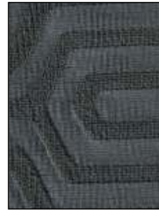
[Mercury Moss 2801]