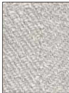
[Anderson Natural 1802]