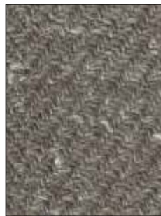
[Anderson Linen 1801]