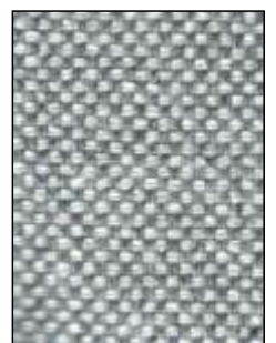
[Tailor Wolf 2103]