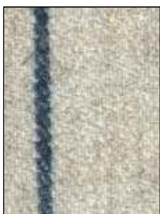
[Saville Ecu 2001]