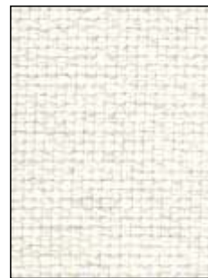
[Tailor Ecu 2102]