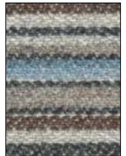
[Jasper Natural 1901]