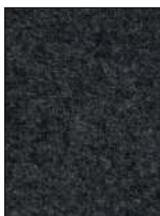
[Amatheon Armour 1206]