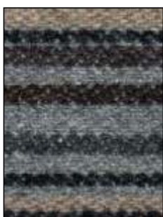
[Jasper Wolf 1903]