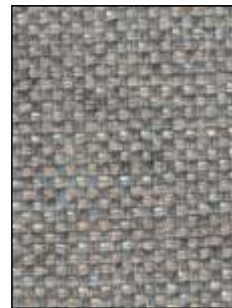
[Tailor Linen 2101]