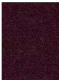
[Amatheon Emperor 1210]