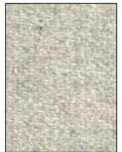
[Amatheon Ecu 1213]