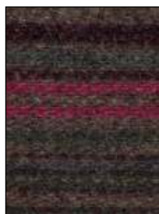
[Jasper Thistle 1902]